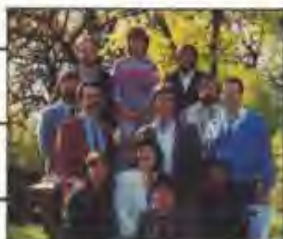
Action Graphics, adaptors for the Atari® 5200