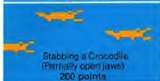
Stabbing a Crocodile (Partially open jaws) 200 points