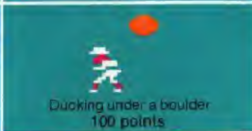
Ducking under a boulder 100 points