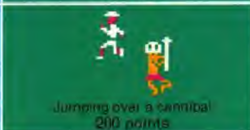
Jumping over a cannibal 200 points