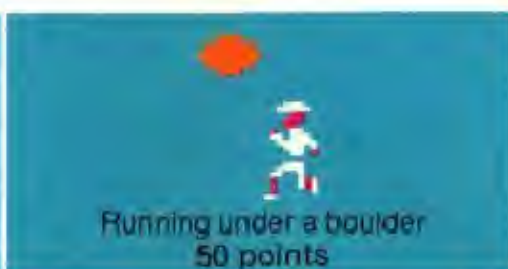
Running under a boulder 50 points