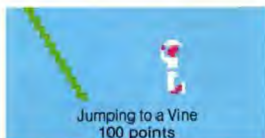
Jumping to a Vine 100 points