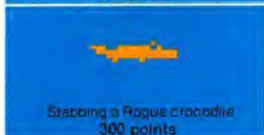
Stabbing a Rogue crocodile 300 points