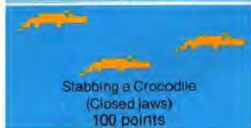
Stabbing a Crocodile (Closed jaws) 100 points