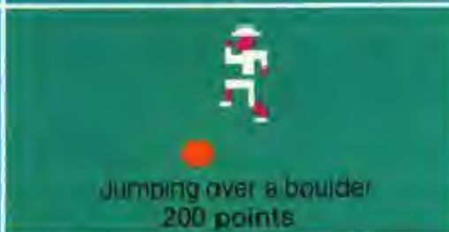
Jumping over a boulder 200 points